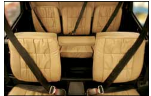
Five seats in an open cabin configuration provide passengers comfort and an unobstructed view.