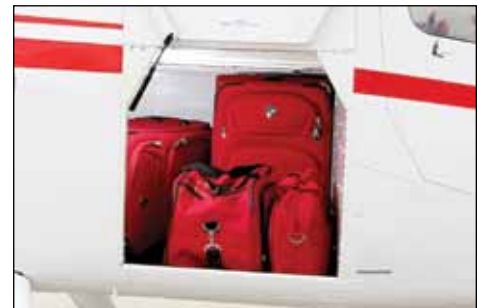
A large baggage compartment accommodates full-sized luggage with room to spare.

Max Gross Weight . . . . . 2,700 lb Empty Weight (incl oil & std avionics) . . . 1,280 lb Max Fuel (73.6 gal) . . . . . 493 lb Passengers & Baggage (with max fuel) . . . 927 lb