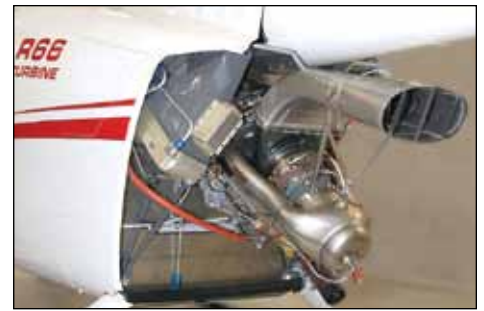
The Rolls Royce RR300 turboshaft engine was specifically designed for the R66.